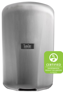
TA-SB Brushed Stainless Steel

MODELS: TA - ABS SB -VOLTAGE (See Chart)